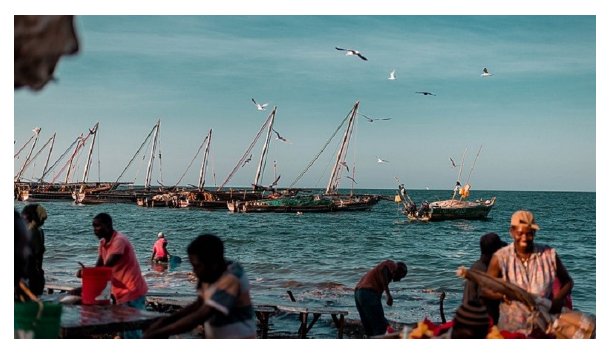
Fishers in Bagamoyo, Tanzania.

A recent update introduced to the CMSY methodology used to assess the status of fish stocks has proven to more accurately predict the catch that a population can support than highly-valued data-intensive models.